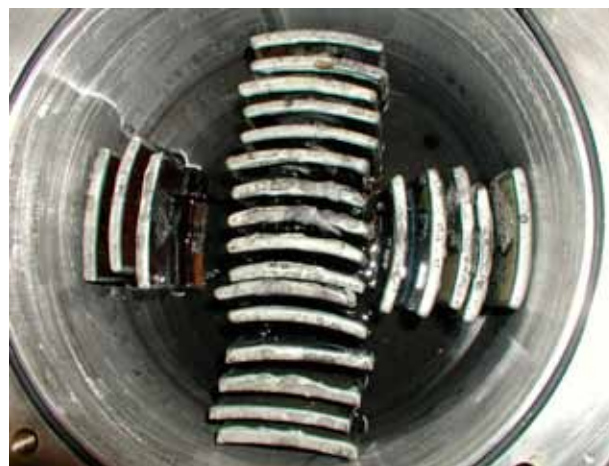
Corrosion testing of coated steel in pipeline environment

The SMOOTHPIPE R&D project is a three year project that started in 2007. The project is sponsored by the Research Council of Norway and the companies listed below.