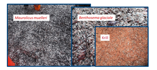
Fig. 2: Maurolicus muelleri, Benthosema glaciale and krill were the three most abundant species, represented approximately 98% of the total

More than 30 mesopelagic species were identified during three surveys with "Birkeland" 2016 - 2017. Maurolicus muelleri, Benthosema glaciale and krill were the three most abundant species and represented approximately 98% of the total in volume in the catches. Catch rates reached up to 12.000 kg per hour.