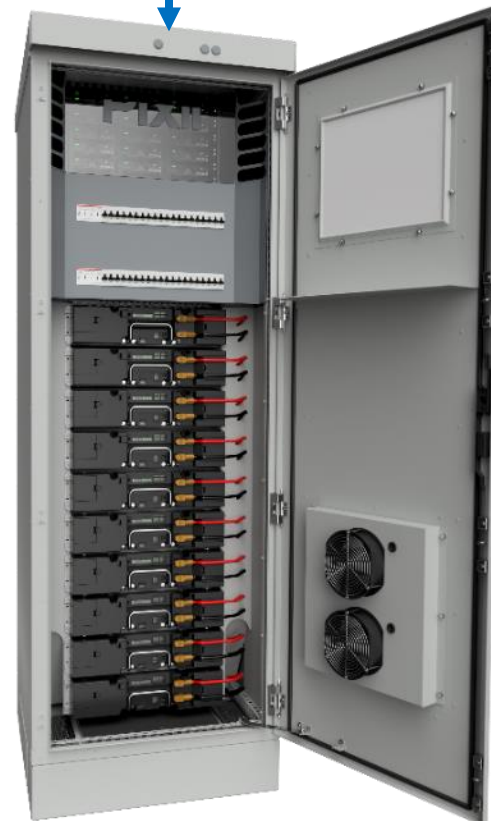
Pixii PowerShaper 30/65