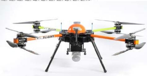
Unmanned Aerial System