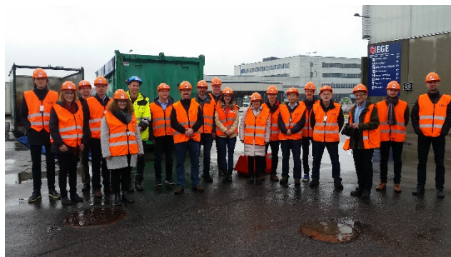
Participants at the open workshop, visiting the EGE Oslo Haraldrud WtE plant

The third GrateCFD workshop and steering committee meeting were arranged in Oslo in November 2018. In the workshop, the partners gave presentations from ongoing activities. The work is in good progress. The WtE 2030 project also arranged its first project workshop and a steering committee meeting there, and in between these two arrangements, an open workshop was arranged focusing on more overarching aspects of MSW combustion. Presentations at the workshop focused on Oslo as the European Green Capital 2019 and WtE development seen from Norway, while two plenary discussions addressed hot WtE topics, namely the Circular Economy and the upcoming, revised BREF WI. The program included a site visit (see picture below) at the EGE Oslo Haraldrud WtE plant.