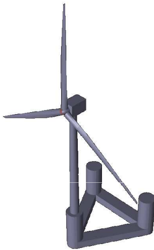
Figure 1. isometric view of the design

The platform is designed in steel and consists of an equilateral triangle with three stabilizing columns, one in each vertex, joined by pontoons. The function of the pontoons is not only structural, but also hydrodynamic, damping the motion of the system. The wind turbine is located in one of the columns, to avoid the use of an additional central column. The number of elements in the water plane is reduced, minimizing the hull cross section area at the sea surface where wave energy is located. The material and construction cost is reduced avoiding bracings and other connecting structural elements. The center of gravity is lowered to increase stability through the use of sea water as ballast.