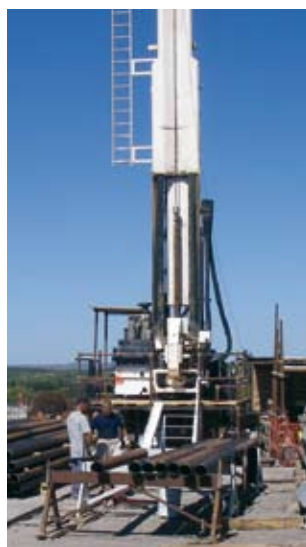
Fig. 4: Core drilling in the Sulcis basin

Moreover, as end-user of the European project MOVECBM, Carbosulcis has recently started a project entitled "Coal-bed methane and enhanced coal-bed methane (CBM/ECBM) recovery and CO 2 geological storage performance assessment at the Sulcis Basin" in collaboration with BRGM, IFP, Imperial College, OGS,