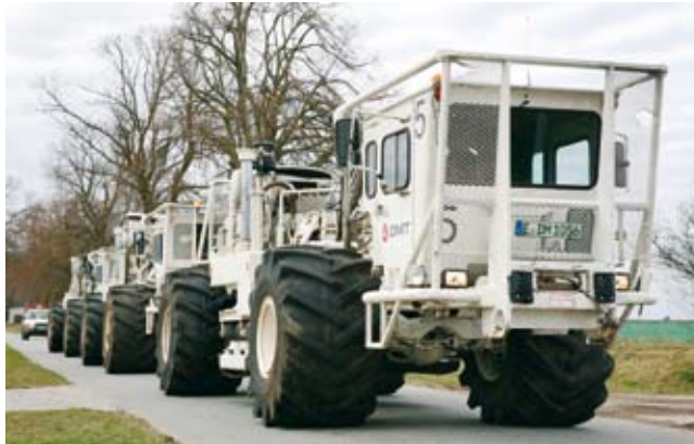
Fig. 3: Seismic vibrators working in the northern part of Denmark