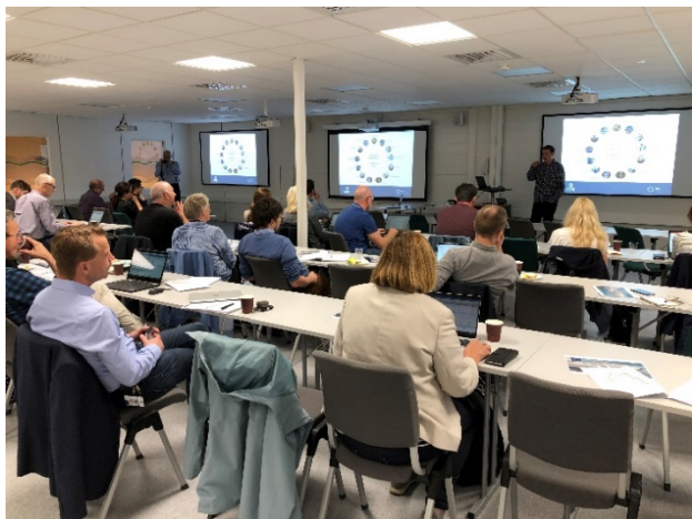
Participants at the BioCarbUp kick-off meeting in Trondheim

The BioCarbUp official kick-off meeting was arranged in Trondheim on 13 June 2019. In the meeting, the project and its activities were presented and discussed, and the project steering committee was established. Based on the meeting some adjustment in the planned work was agreed on, to properly account for the individual industries' needs. Each year annual work plans will be proposed and agreed on, based on the project description while also taking into account industries' needs along the path towards project completion in 2022.