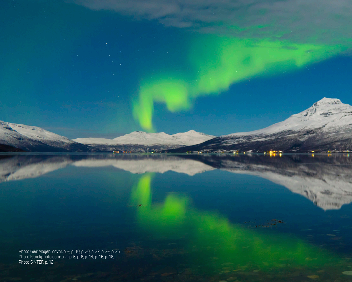
Photo Geir Mogen: cover, p. 4, p. 10, p. 20, p. 22, p. 24, p. 26 Photo istockphoto.com: p. 2, p. 6, p. 8, p. 14, p. 16, p. 18, Photo SINTEF: p. 12