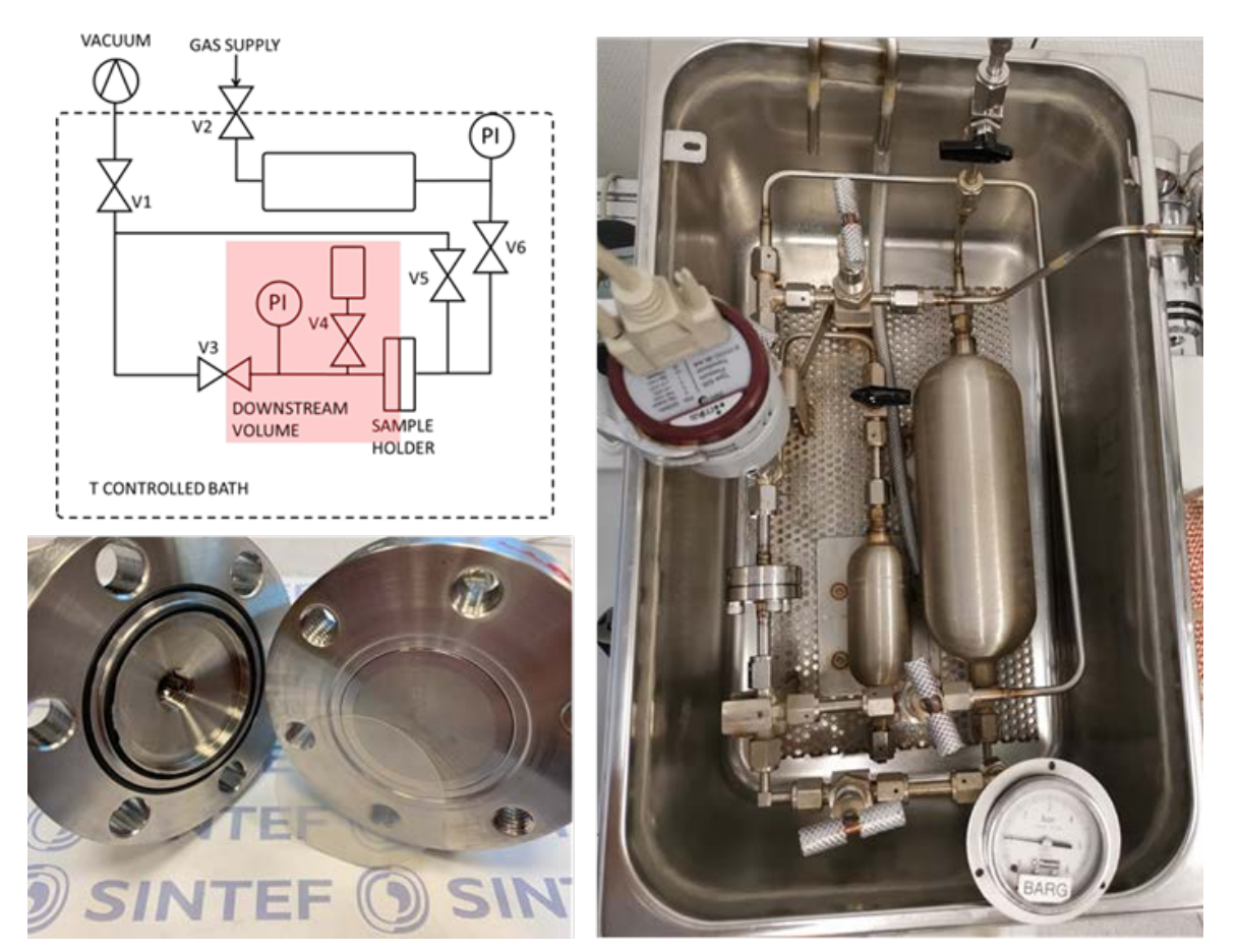
Figure 2. Gas permeation equipment to measure the CO_2 transport properties up to 25 bars, in the temperature range of 5 to 70 °C.