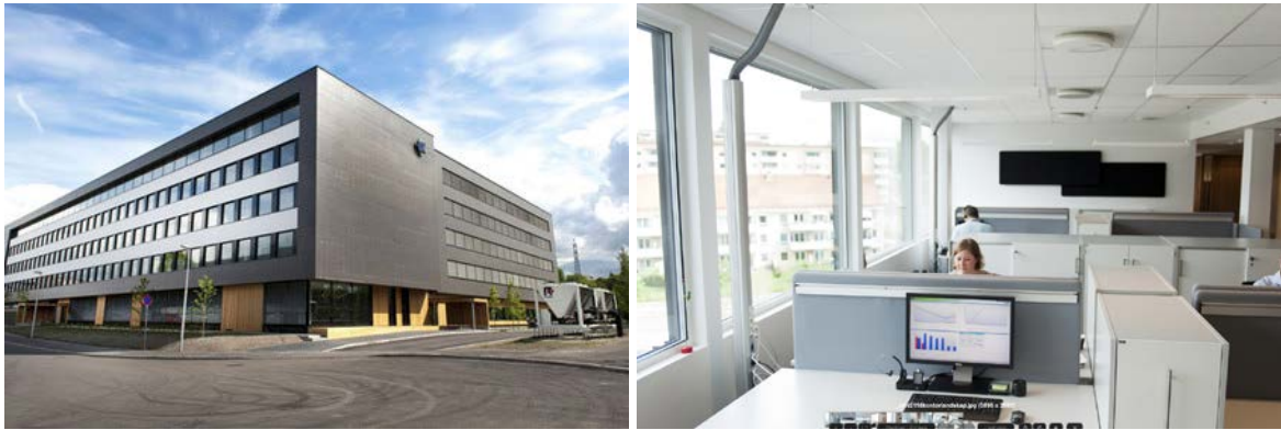
Figure 1: a) GK environmental building, Oslo. b) View of the open plan offices.

Evaluating the perceived indoor climate in buildings satisfying the passive house standard (NS3701, 2012) is crucial to validate their use in countries with cold climate. The aim of this study is to do so with occupants carrying out their daily tasks in real conditions, and therefore to provide a valuable addition to studies of the perceived indoor climate in controlled conditions.