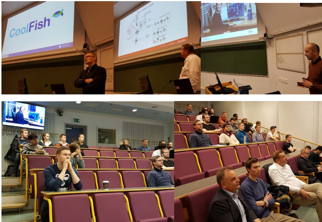
Photos from presentation at the University of Tromsø, 27.2.2020

The plan was to have a workshop on March 23 with Norwegian industry partners. Due to the Corona situation, it was cancelled, but we will rearrange it when possible. We had also planned to attend a conference (International conference on sustainability and the cold chain) in April, but this has been postponed and will take place after the summer. At this conference, we will present research related to CoolFish and organize a workshop for the scientific community. We have also sent 3 abstracts to the Gustav Lorentzen conference, which will be held in Japan in December. We are also planning to send articles to trade journals in Norway and to participate in Nor-Fishing (a fair in Trondheim in August for the fishing industry).