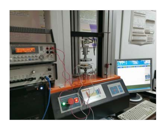
Set-up in UPT ICR measurement