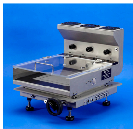
Fig 1. The sweating guarded hot plate or 'skin model'.

The skin model is a new addition to the suite of textile and physiological testing offered by SINTEF. It is a convenient tool for assessing and screening performance of a textiles and is valuable to be used in conjunction or as an alternative to the thermal manikin or physiological measurements. The equipment is a unique model developed specifically for SINTEF and is the only skin model of it's kind with an ability to test in conditions below room temperature and down to -20°, meaning only SINTEF has the ability to test textiles in simulated arctic conditions.