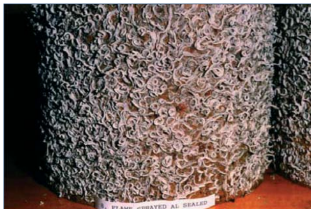
Figure 3. Thermally sprayed Al exposed 2 years in seawater.

Metallic coatings used in seawater and marine environments are hot dip zinc, thermally sprayed zinc and aluminium (Figure 3). Such coatings are less noble than steel and protect by CP. The self corrosion of the coating depends of the actual condition.