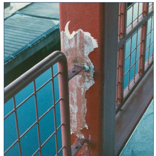
Figure 2. Flaking of a top coating. The primer coat was of wrong type

CP can be used if the object is surrounded by a conductive electrolyte. Anodes in a less noble material (Zinc or Aluminium) corrodes instead of the steel and thereby protects it. The number and placement of anodes must be specified.