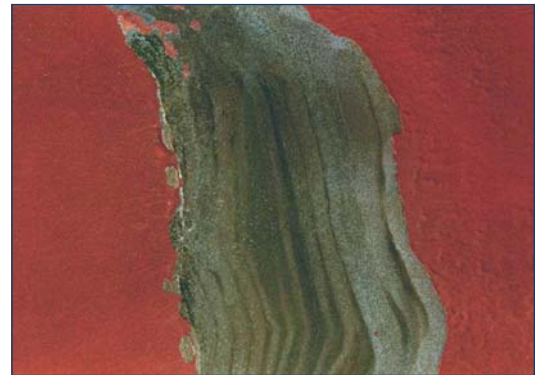
Figure 1. Cathodic disbonding of ship hull coating

Constructions and ships submersed in seawater are normally protected by a combination of coating and cathodic protection (CP). The coating is applied to decrease the amount of anodes, to reduce marine growth and reduce drag forces, in addition to visual effects. Coatings not resistant to CP may suffer from cathodic disbonding (Figure 1) and selection of the right coating is important.