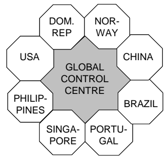
Figure 2: GCC position in the SC

The GCC consists of four core elements, the global control model and decision support, ICT, organization and the physical environment. In addition, potential benefits of the GCC are described.