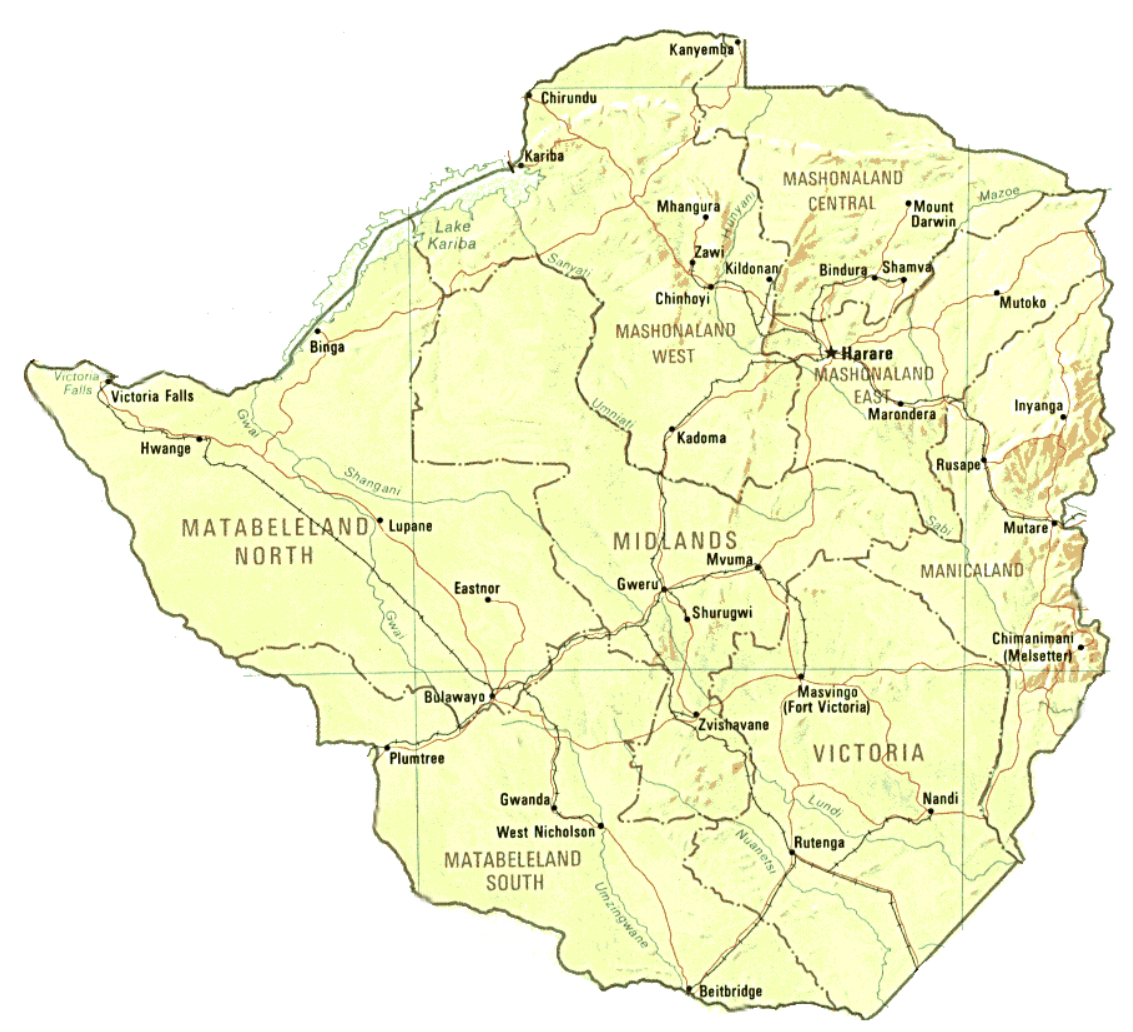
Political map of Zimbabwe – regions surveyed: Matabeleland North & South (including Bulawayo), Midlands, Manicaland.

Data collection was carried out in Matabeleland in November – December 2001, in Manicaland in April - May 2002, and in Midlands in January – February 2003. All three data collections applied stratified single-stage cluster sampling. The Central Statistical Office carried out sampling within each Region, applying the current National sampling frame. This is an area frame based on the Enumeration Areas (EAs) and stratified by regions, and within regions by urban and rural locations. The EAs were selected with equal probability for inclusion in the study.