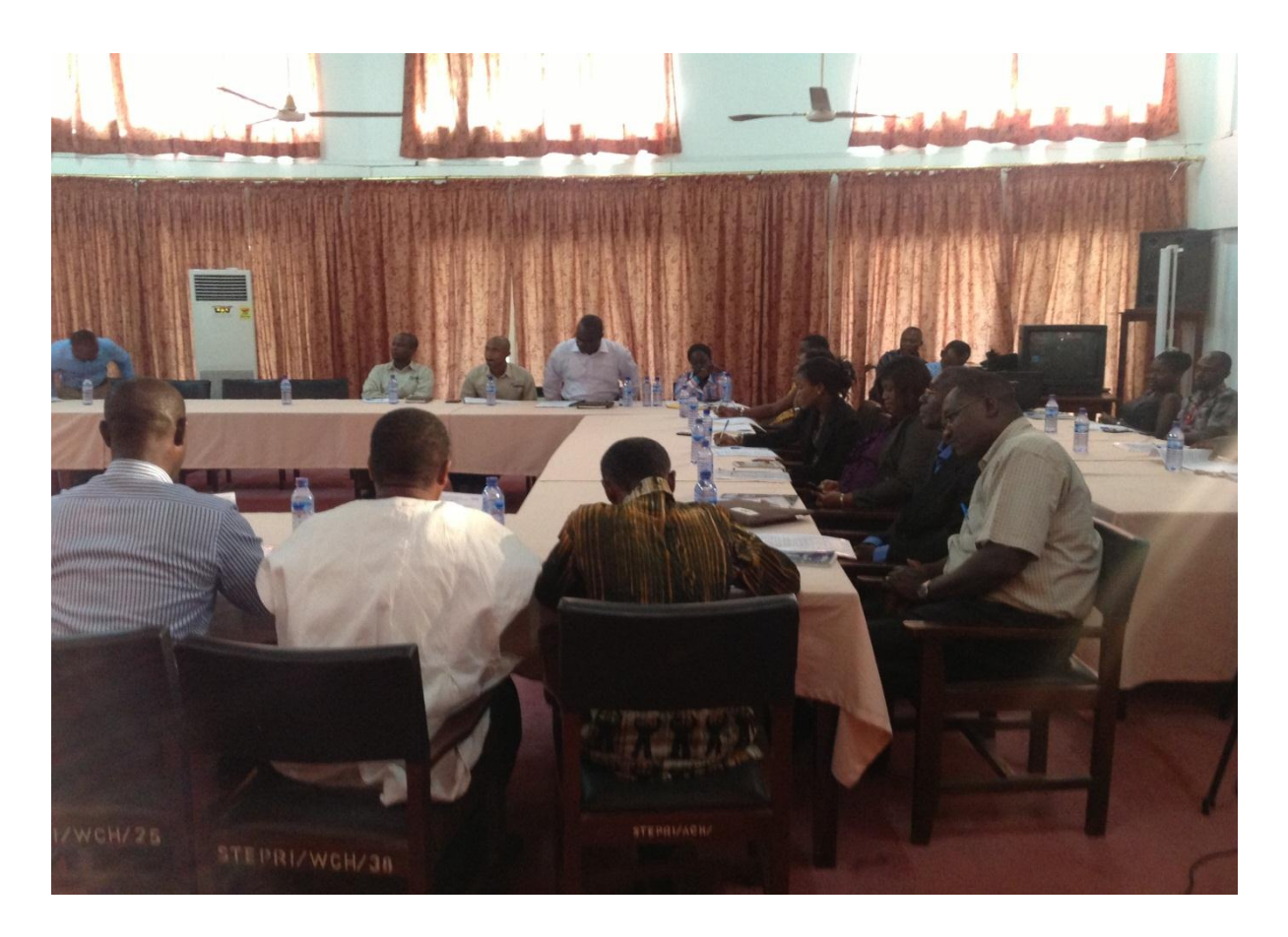
Fig 6. Section of participants

He said that in order to adapt to these climate change impact, the key requirement to reduced vulnerabilities and increased resilience of communities and households is the adoption of rain water harvesting and storages system such as surface systems, boreholes and paved surfaces.